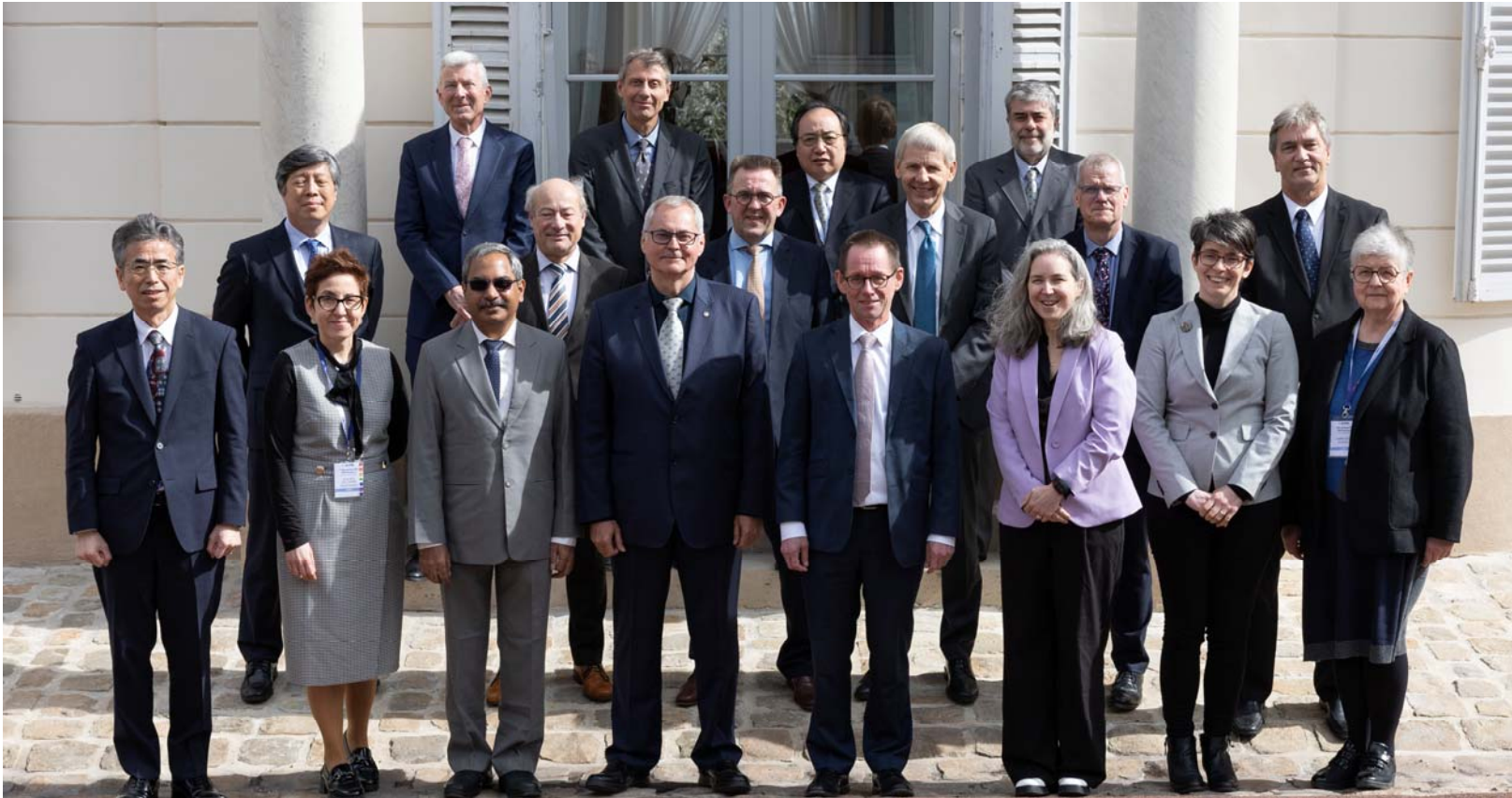
International Committee for Weights and Measures