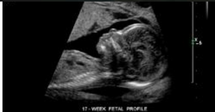
17-WEEK FETAL PROFILE