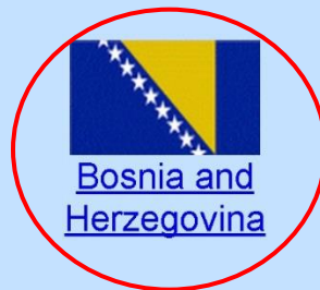
Bosnia and Herzegovina