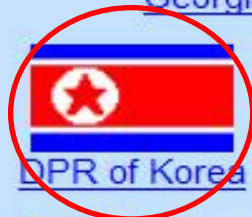
DPR of Korea