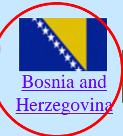
Bosnia and Herzegovina