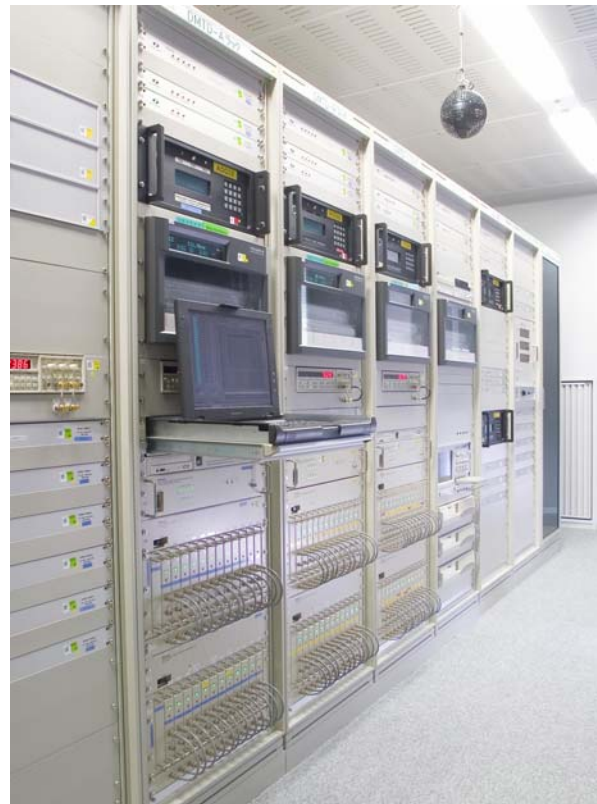
Fig. 1 NJST system (excluding the atomic clocks and the computers)

TA(NICT) is calculated by using 18 cesium clocks. Hydrogen masers have not been used for the calculation yet. We estimate the rates of cesium clocks according to the latest 30days. TA(NICT) is calculated every an hour. The signals of UTC(NICT) are generated from a frequency adjuster (AOG, Auxiliary Output Generator) which uses a 5 MHz of hydrogen maser as a reference. We adjust the frequency of AOG once a day at UTC 1:20 so that UTC(NICT) traces the TA(NICT). Occasionaly some offset may be added to keep UTC(NICT) close to UTC. The rate of the reference hydrogen maser is