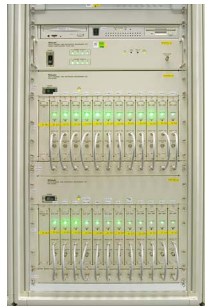
Fig. 3. 24-ch DMTD system