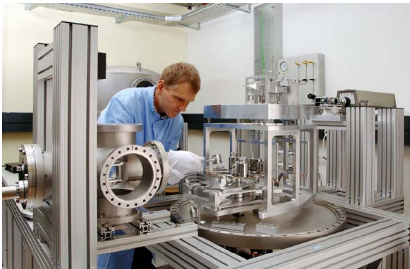
Figure 1 The new METAS 1 kg vacuum mass comparator coupled to the surface analysis system

BNM-INM participated in and coordinated the EUROMET Project 551 related to the measurement techniques to characterise the roughness of mass standards. Measurements were made on two OIML weights (500 g and 2 kg), on a 50 g cylindrical mass in stainless steel and on a 100 g cylindrical mass in alacrite. Five laboratories participated in this project: BNM-INM, NAWC (US), SP (SE), LPUB (FR) and NIST (US)). Five systems are involved (3 based on optical methods and 2 on contact-type profilometer (Talystep and near-field microscope). This project is now completed and the final report (BNM-INM/CNAM/Ma-2003-01) sent to the participants. Following this project, two publications are submitted to Metrologia.