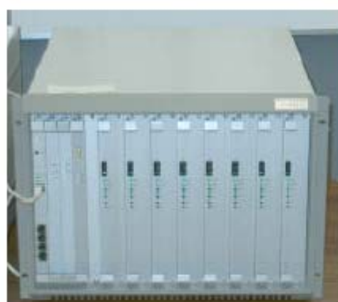
Fig. 2 Multi-channel TWSTFT modem developed at CRL.

Besides that, CRL has developed a new time transfer modem for TWSTFT. Its main feature is the multi-channel operation which can realize simultaneous time transfer among the participating stations. At present, we are testing its performance using JCSAT-1B among CRL, NMIJ, TL, KRISS, SPRING, and NTSC, and using PAS-8 among CRL, NML, (TL), and (KRISS). For regular time transfer, 7 days/week time transfer using this multi-channel modem has started from latter half of March 2004.