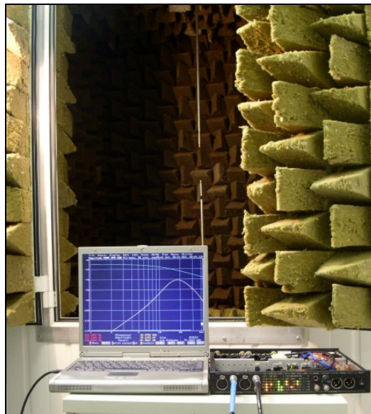
Figure 1 – Anechoic chamber (2.5 m 3 ) and the measuring system (Aurélio CMF22 + Monkey Forest software).

Figure 1 presents the measuring system used to determine the electrical transfer impedance of the acoustical system.