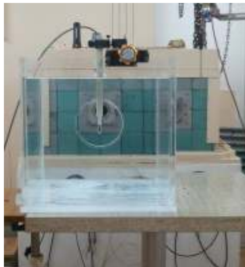
Fig. 1. The measurement system of the absorbed dose to water at the Central Office of Measures

We built the secondary standard of absorbed dose to water (fig. 1). Our secondary standard is ionization chamber type NE2571, which is calibrated in the BIPM ^{60}\text{Co} radiation beam. The ionization chamber is enclosed in a polyethylene housing and positioned with the reference plane at a depth of 5\text{ g cm}^{-2} . The water phantom is a cube of side 35 cm with a circle front window of 15 cm diameter and thickness 4 mm.