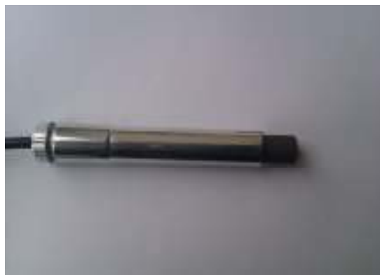
Fig. 3. The ionization chamber (prototype AK13A)