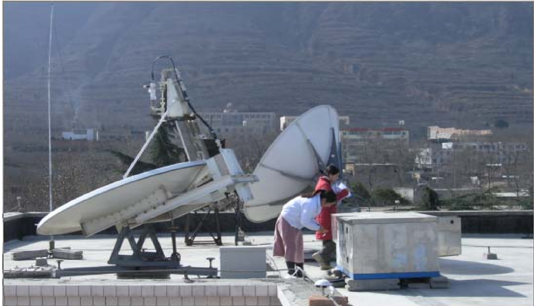
Fig.8 Two earth stations