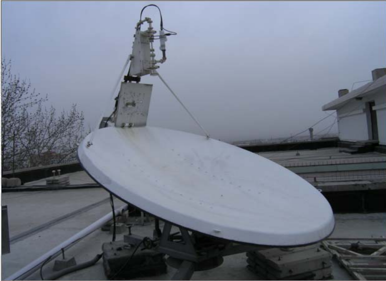
Fig.1 1.8 meters ellipse antenna