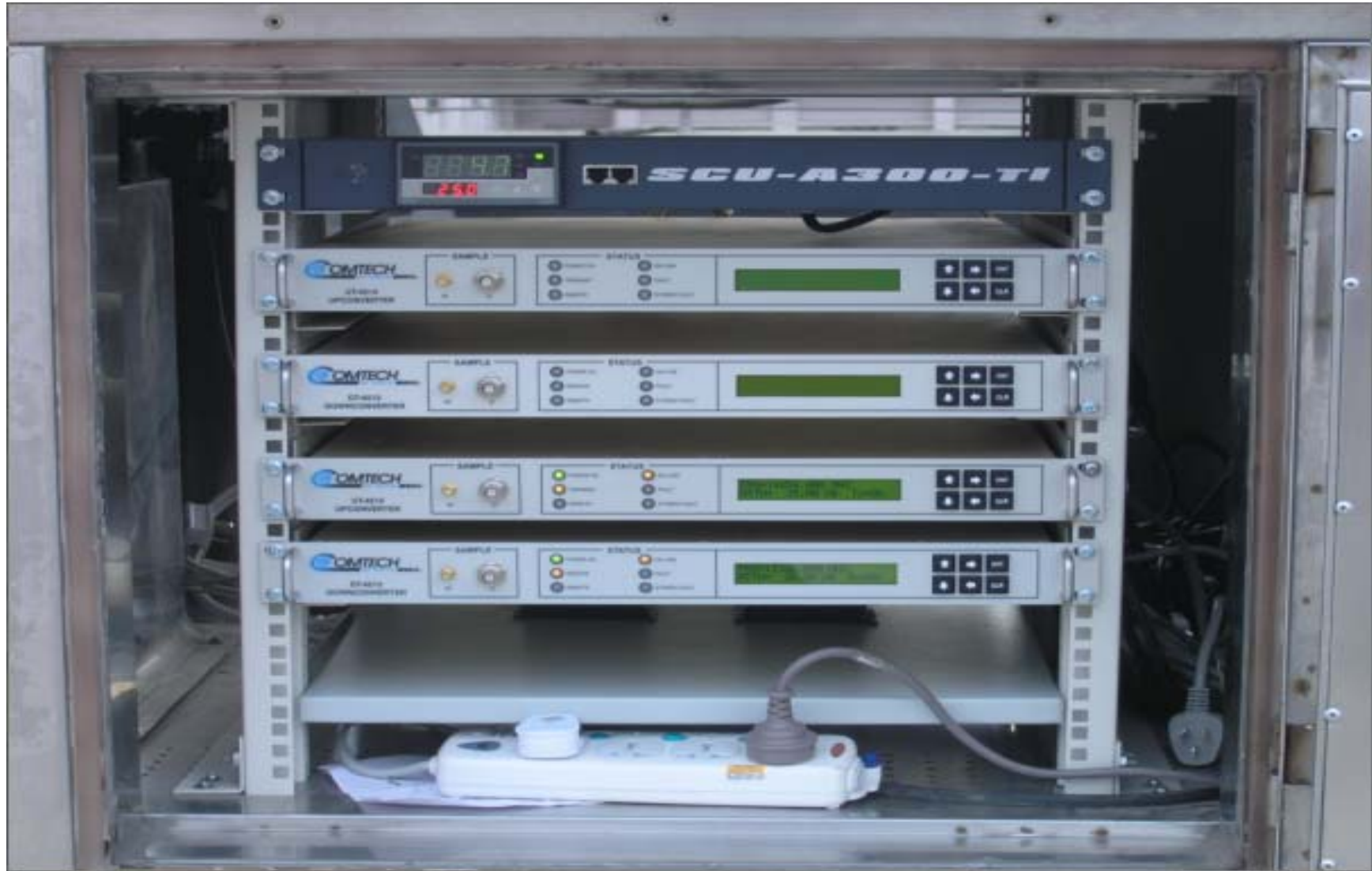
Fig.5 Two sets of Up/Down Converters