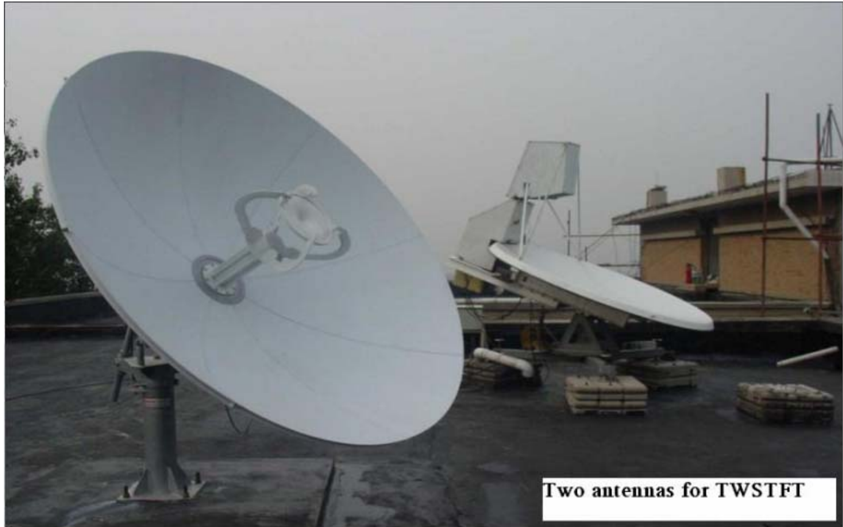
Fig.4 Antennas for TWSTFT in NTSC