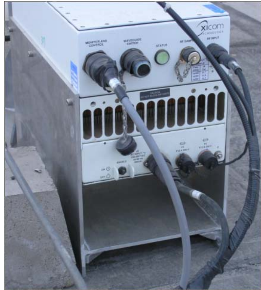
Fig.6 SSPA for Main and Sub system