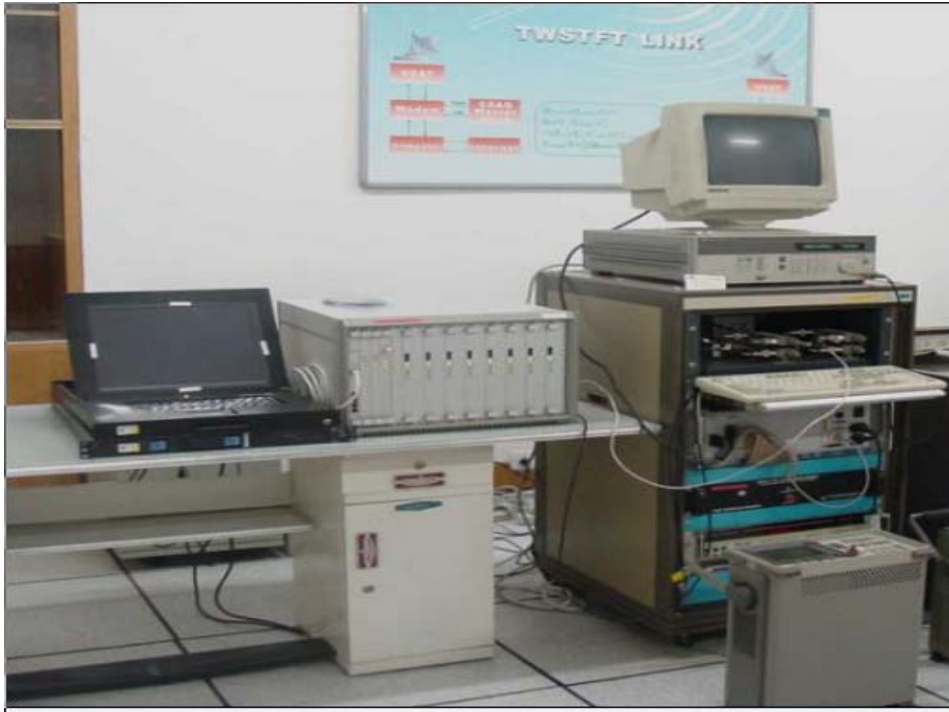
Fig 3. NICT Modem and AOA Modem