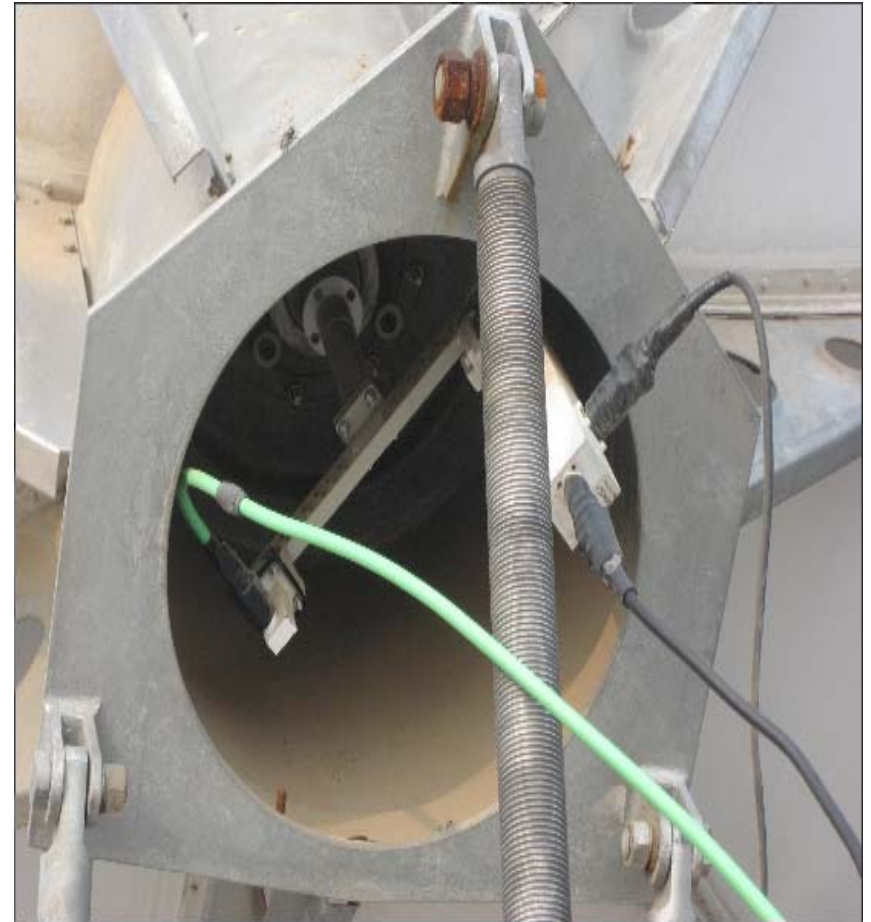
Fig.6 2.4m Antenna for Pas4 and improved polarization