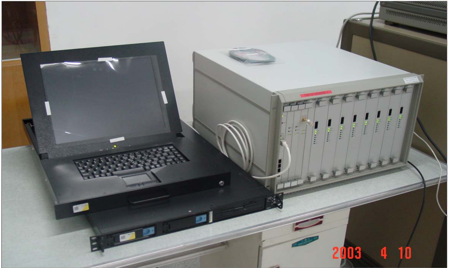
Fig 2. NICT Modem