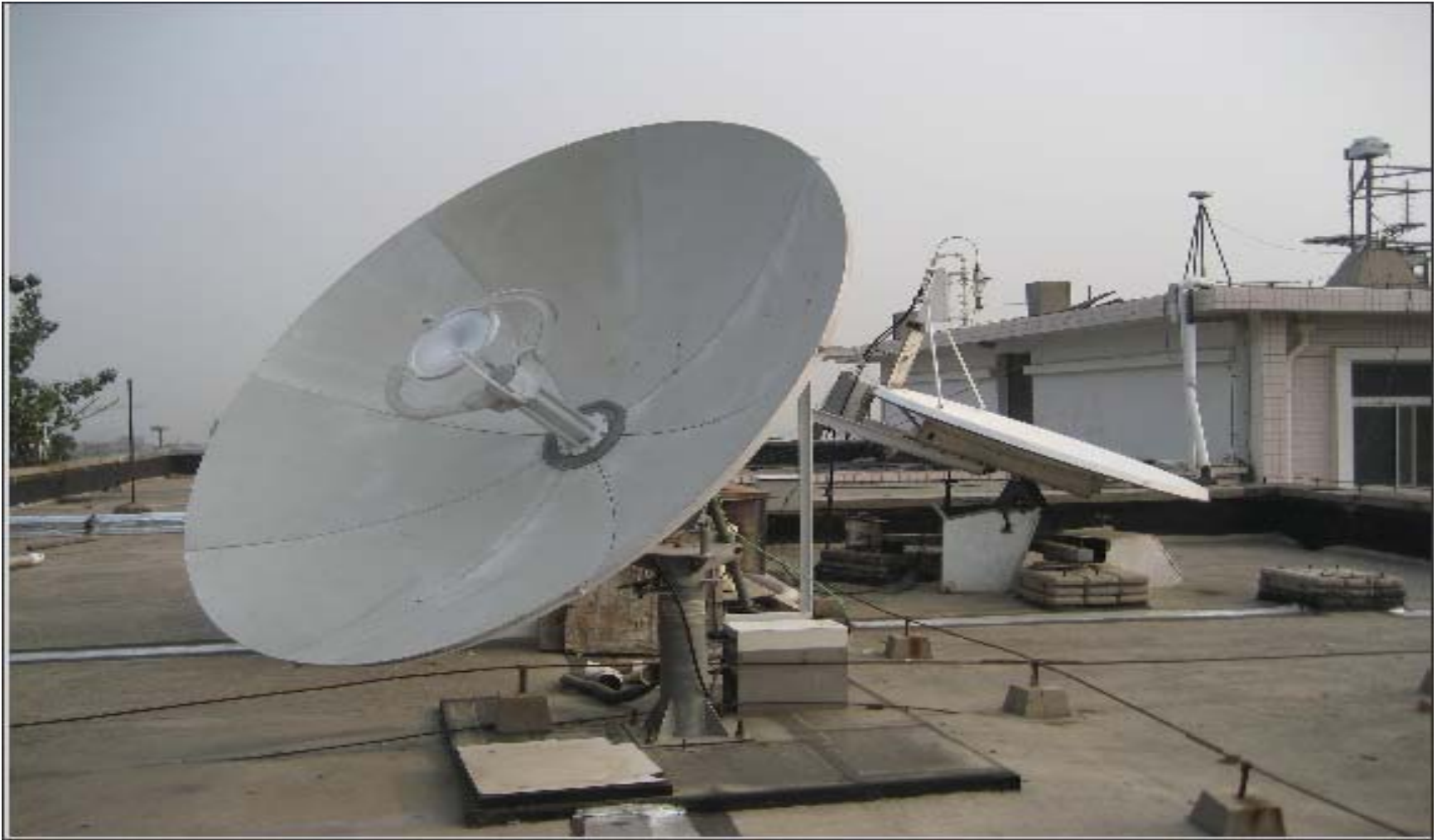
Fig.3 Two earth stations for TWSTFT