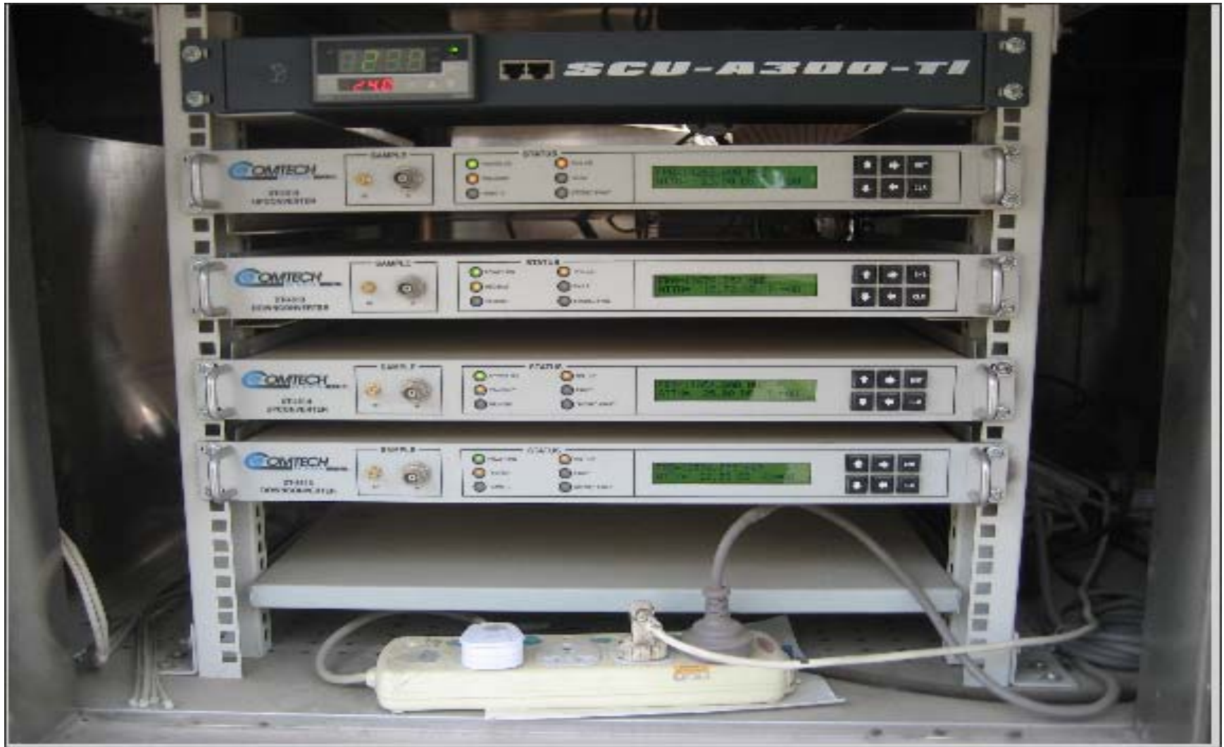
Fig.4 Two sets of converters