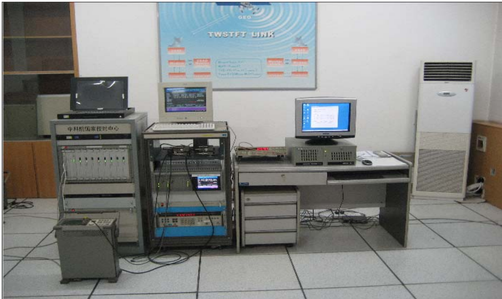
Fig.5 TWSTFT Lab in NTSC