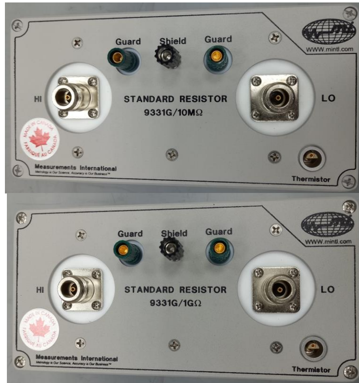
Figure 1. The travelling standards

The standards are manufactured by Measurements International (CA), Model 9331G. The model 9331G is based on a NIST design which includes a split guard design and internal temperature sensor. The split guard circuit design allows for applying independent guard voltages at each side of the resistor. Connections are type N. The Model 9331G is hermetically sealed in a shielded enclosure and isolated from the case.