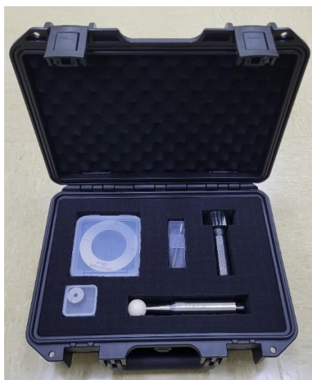
Figure 1. Transporting case of the gauges

The organization costs will be covered by the pilot laboratory, which include the standards themselves, the cases and packaging, and the shipping costs to the next laboratory. The pilot laboratory has no insurance for any loss or damage of the standards during the circulation.