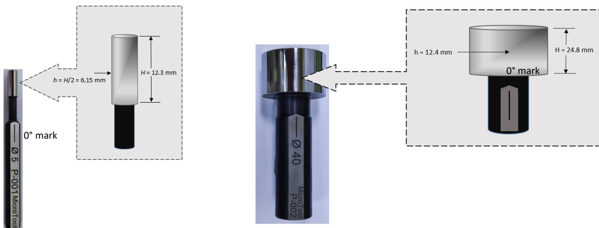
Figure 4. Measuring direction on the plugs: 5 mm plug (left) and 40 mm plug (right)

The diameter of the 5 mm plug gauge should be measured at the marked line 6.15 mm below the top/upper surface (0° mark, according figure 4) . The upper side of the 5 mm plug is at the end of the 12.3 mm worked cylindrical surface. The lines defining the diameter measurement direction are marked on the not worked cylindrical surface of the plug. The diameter of the 40 mm plug gauge should be measured at the marked line 12.4 mm below the top/upper surface (0° mark, according figure 4) . The upper side of the 40 mm plug is at the end of the 24.8 mm worked cylindrical surface. The lines defining the diameter measurement direction are marked on the not worked cylindrical surface of the plug.