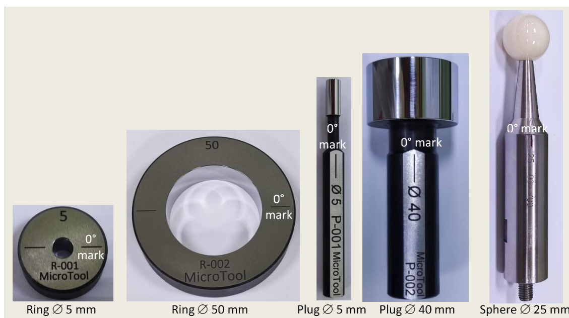
Figure 2. Diameter gauges

A coefficient of thermal expansion (CTE) of 12 \cdot 10^{-6} \text{ K}^{-1} is obtained by the manufacturer of the steel gauges, whereas a CTE of 4.6 \cdot 10^{-6} \text{ K}^{-1} is obtained by the manufacturer of the ceramic ball. They should be used as such for any corrections to 20.0 °C.