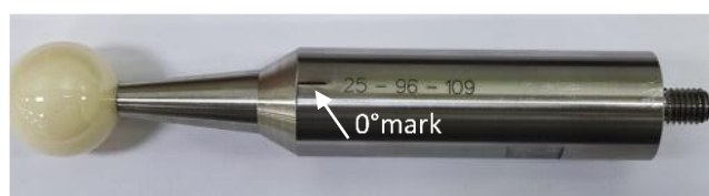
Figure 5. Measuring direction on the sphere

The diameter of the ceramic ball should be measured at the equator. The diameter measurement direction is marked on the steel base support by a mark close to the Serial Number (Figure 5).